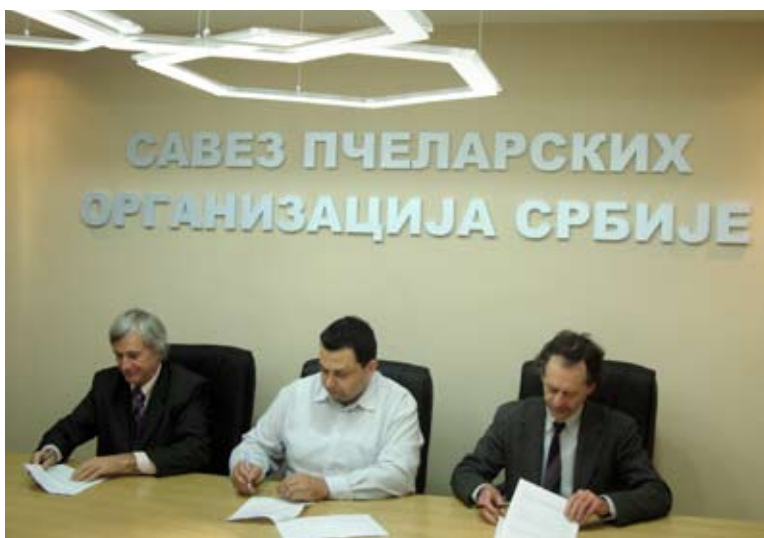
Signing of the contract between Apimondia and Serbian Federation of Beekeeping Organization for organising APIECOTECH 2012 Symposium

President of the Serbian Federation of Beekeeping Organizations President of the Local Organising Committee